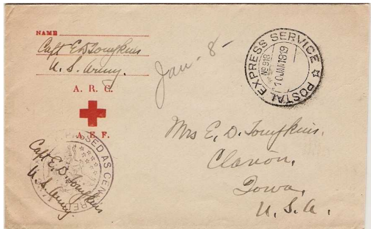
Figure 4. 1919 envelope from Army Post Office 918 to Clarion, Iowa with sender's name and branch of service and American Red Cross logo (Author's collection)