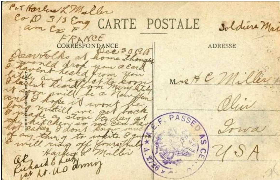
Figure 2. 1918 postcard from France to Olin, Iowa with sender's name and military unit, censor's stamp and signature, and Soldier's Mail

making a stove to cook hot cakes. This postcard, which has a censor's stamp and signature and "Soldiers Mail," was on sale on eBay® by a vendor who permits Philgen.org to use his photographs. 139