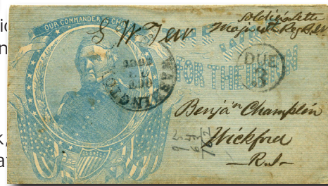
Figure 3: envelope from Washington, DC, to Wickford, RI, with illustration of General Winfield Scott and The War for the