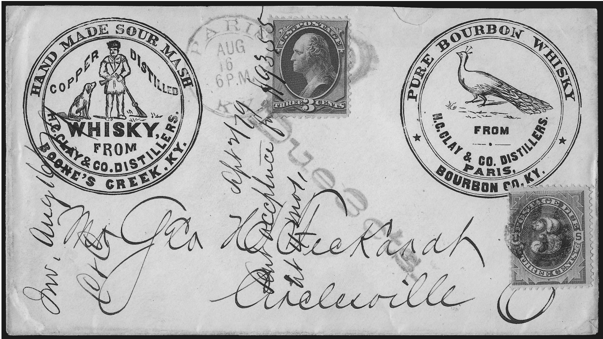
Figure 2 1879 envelope from Paris, Kentucky to Circleville, Ohio advertising Kentucky bourbon whiskey

+ & & OD\ DQG & RPSDQ\ 'LVWLOOHUV ORFDWHG LQ VHQW DQ HQYHORSH WR *HRUJH + )HFNDUGW RI & LUFQ 6 DQG KH LV VKRZQ DV + 7 $ *HRUJH + 3)LFNDUGW ' D GUXJLVW LV LQ WKH 8 & LUFQHYLOOH 8 6 FHQVXV